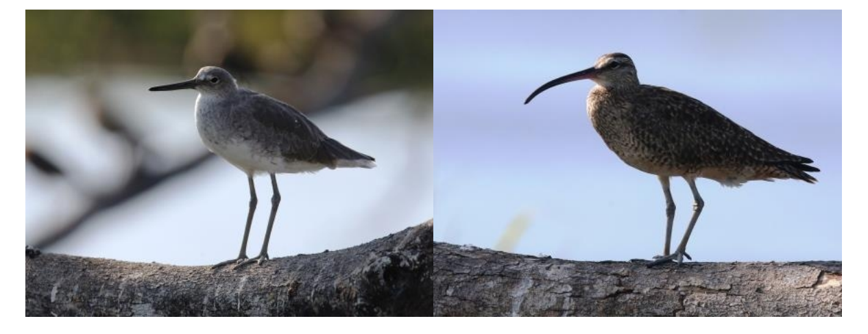
The first day totals were 81 bird species of which all but 2 were new to us, a good selection of mammals and reptiles and a small number of butterflies.

We then went to the beach to see a beautiful sunset before returning to our accommodation for dinner.