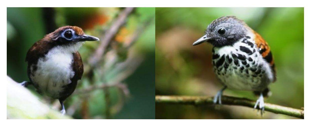
Day 19 Saturday 19<sup>th</sup> March

Got up at 5.00am to rain but it had stopped as we met up with Andi and Gabor at 6.00am.