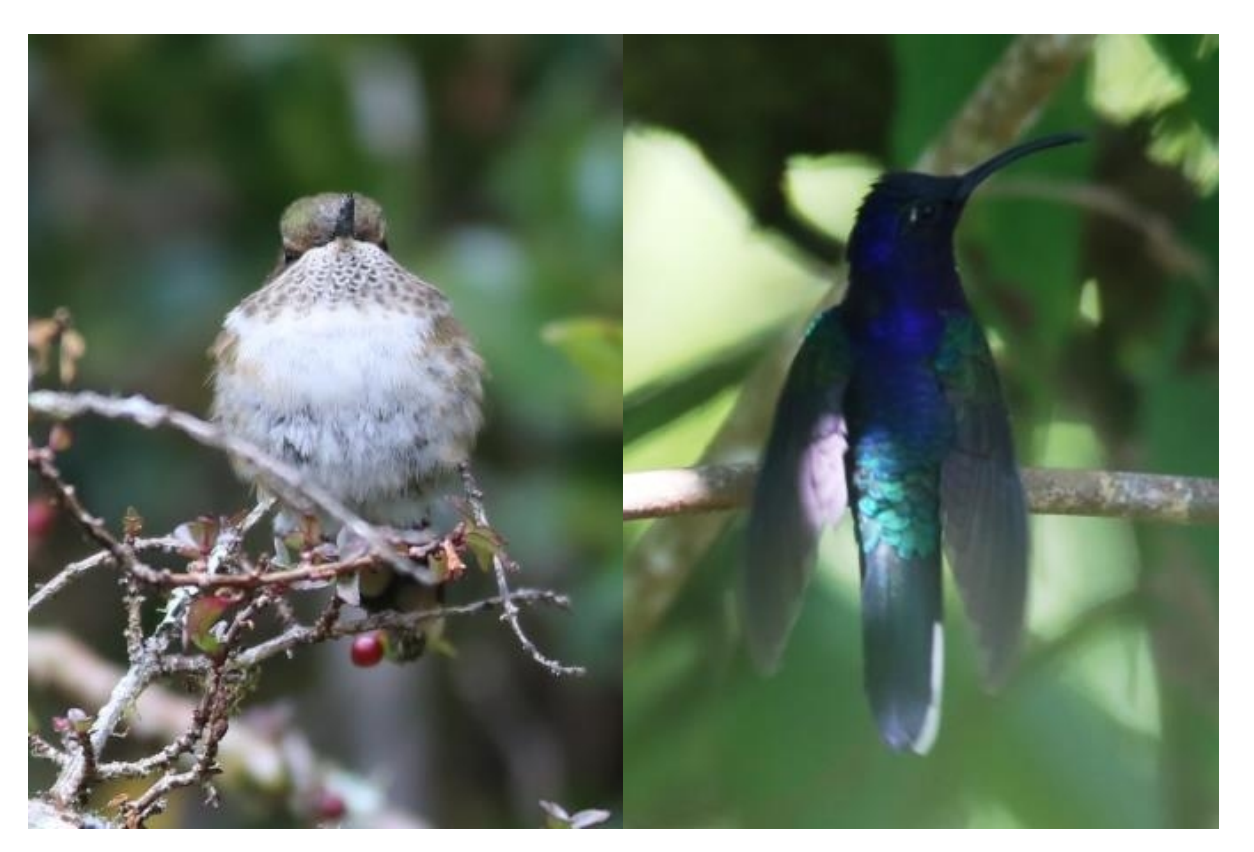
Day 14 Monday 14th March

Went out about 6.00am wearing a number of thin layers of clothing as it was quite