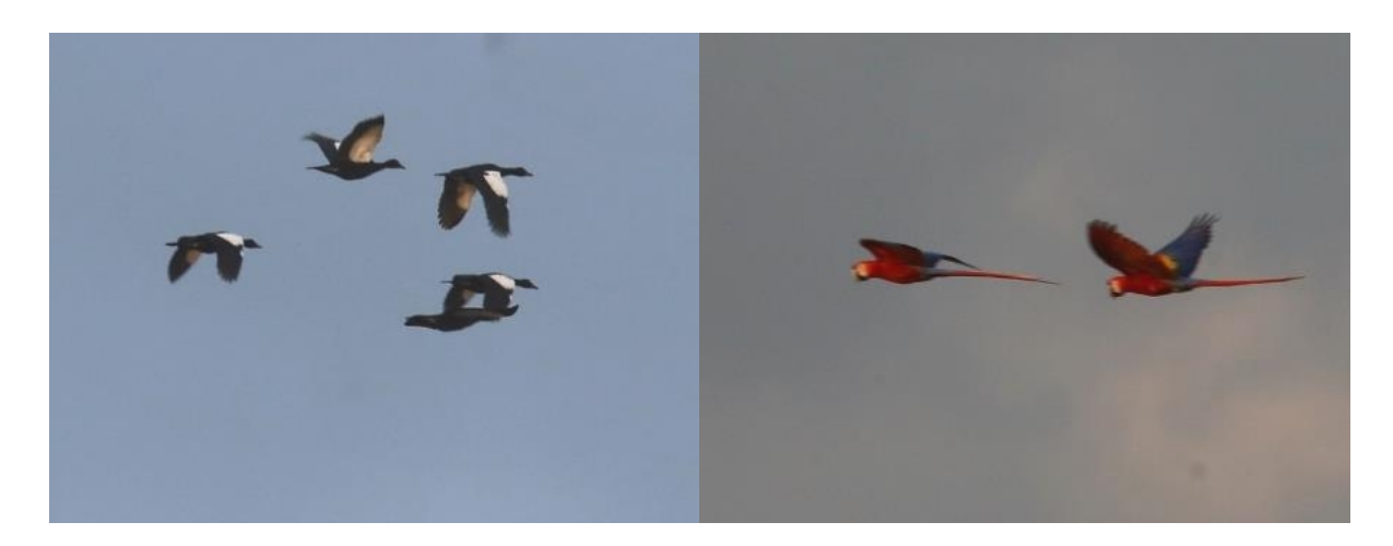
Day 3 Thursday 3<sup>rd</sup> March

Up at 5.30am and out to wander in the gardens by 6.30am. On the way to breakfast a Coati very kindly posed for photographs while eating its own 'breakfast'.