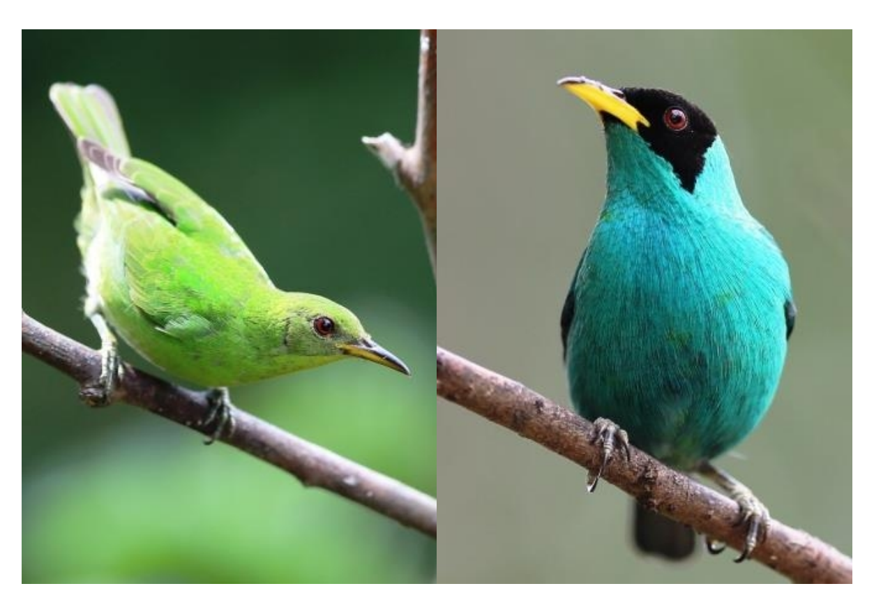
Day 12 Saturday 12th March,

Sat on our balcony, overlooking a valley as the sun came up. Number of good birds seen either in the tree tops or on the roofs of adjoining lodges. Had an early