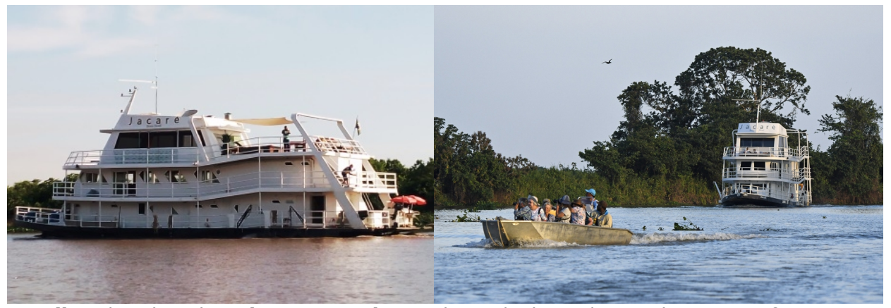
Brazil and within that the Pantanal is without doubt a dream destination for any nature enthusiast. With our itinerary making a full circle on the rivers we visited the followings nature parks: Parque Estadual Encontro da Aguas, Parque Nacional Mato Grosso & Reserva Ecologia Taiama .

Usually after a tour like this when we think about what was the best of the tour, it is not just simply some of the best bird or mammal species which cross our mind, but the boat tour experience itself. Travel through huge protected areas full with wildlife, visiting side channels on smaller boats, but also the Transpantaneira road itself all were parts of a lifelong experience. Even well experienced travellers said this was one of their best ever wildlife tour! Regarding mammals out of the 23 species observed during the tour obviously the 12 Jaguars stood out with so many different actions - hunting, swimming, grabbing the leftover of a cow, walking alongside, sleeping. But watching Giant Ant-eater , Ocelot , 4 Tapirs , Tayra , different monkeys and deers , fox , raccoon , peccari , capibara and of course Giant and Tropical River Otters and plenty of bats were all part of the joy.