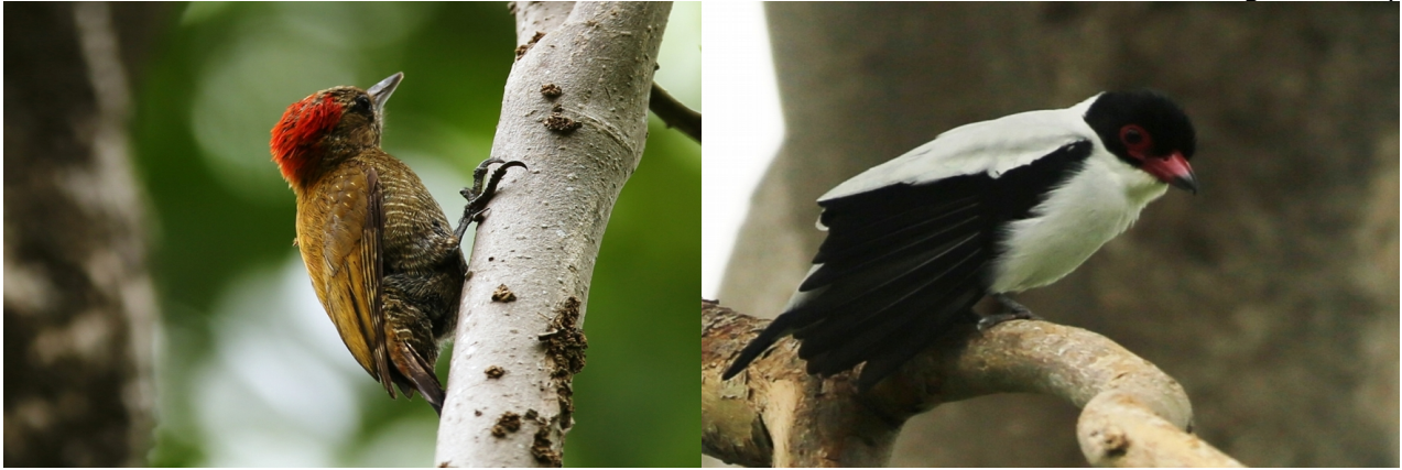
Day2 27thOctober 2024

Dinner was excellent and we all felt tired and could not wait for a well-deserved good sleep.